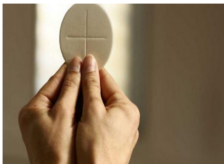
The Body of Christ